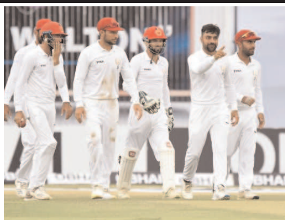
With four wickets in hand, the hosts were given 18.3 overs to survive after play resumed in the final session following a rain break but they succumbed with three overs to spare.

In only his country's third Test match, Rashid took three of the last four wickets to finish with a match haul of 11 wickets, helping Afghanistan bowl out Bangladesh for 173 runs in the second innings.