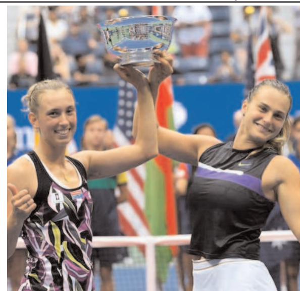
"I've enjoyed every second on the court."

"It's like something unbelievable this year happened, especially in doubles," Sabalenka said.