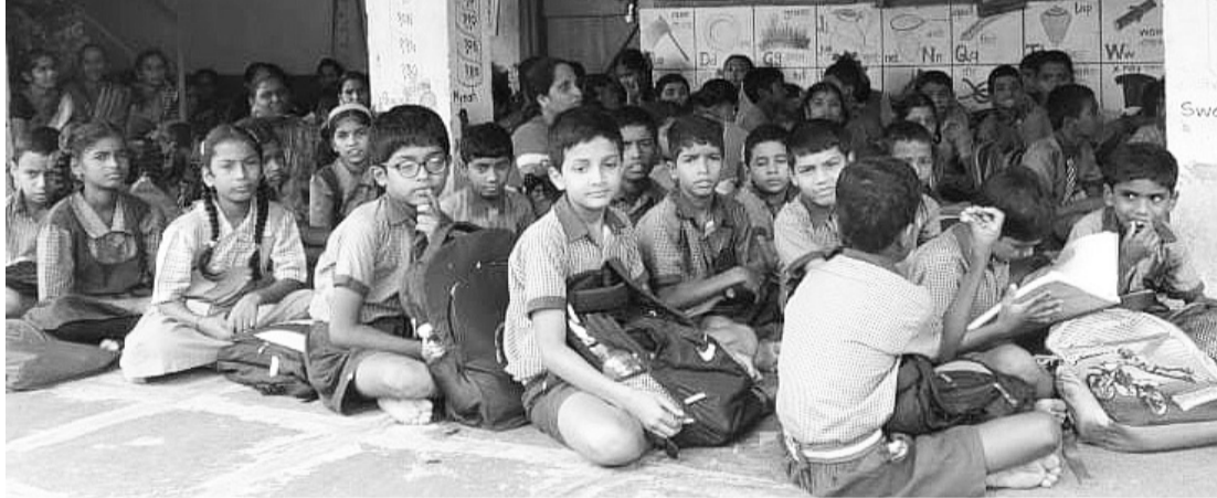
शिक्षक मिळावा यासाठी आंदोलन करताना विद्यार्थी आणि पालक.