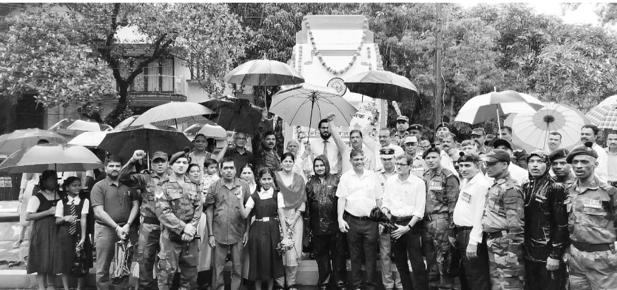
वाळपई शहीद स्मारकाजवळ कारगिल विजय दिनानिमित्त जमलेले मान्यवर.