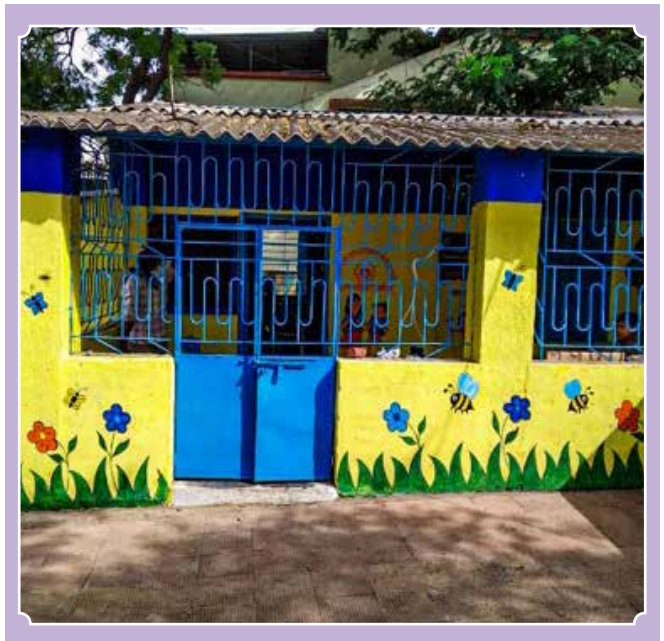
GPPL renovates the Anganwadi - Kids Preschool at Vasai