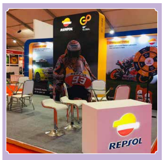
Repsol Stall at Auto Car Expo, Mumbai