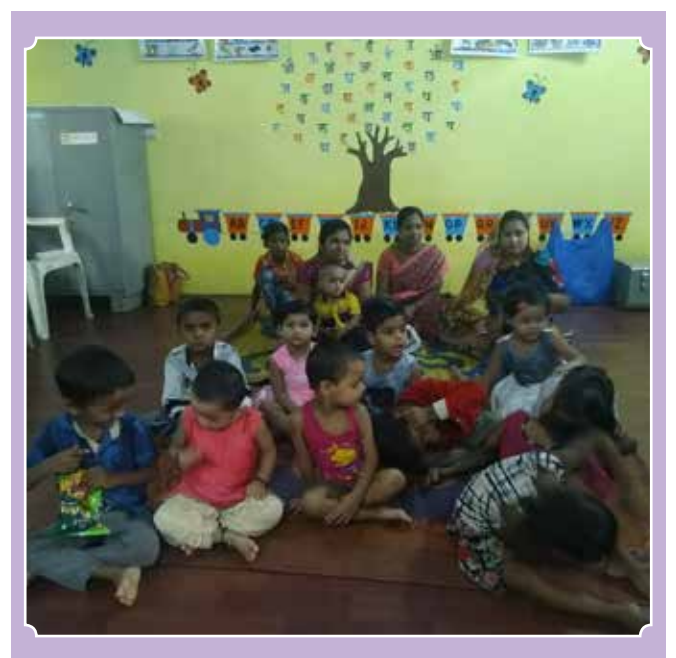
School Kids at the newly renovated Anganwadi