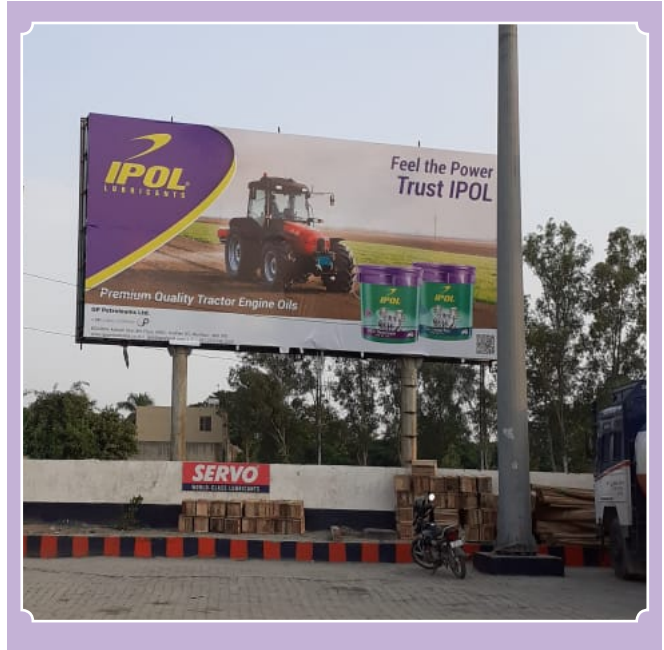
IPOL hoarding at IOC Petrol pump