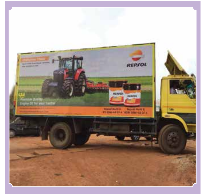
Repsol Truck Branding - Karnataka