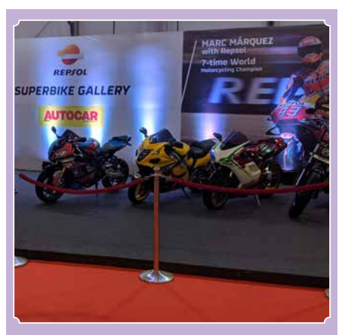
Repsol Super Bike Gallery at Auto Car Expo, Mumbai