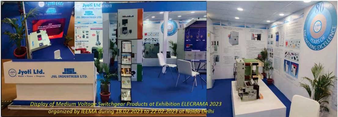
Display of Medium Voltage Switchgear Products at Exhibition ELECHEMA 2023 organized by IEEMA during 18.02.2023 to 22.02.2023 at Noida Delhi