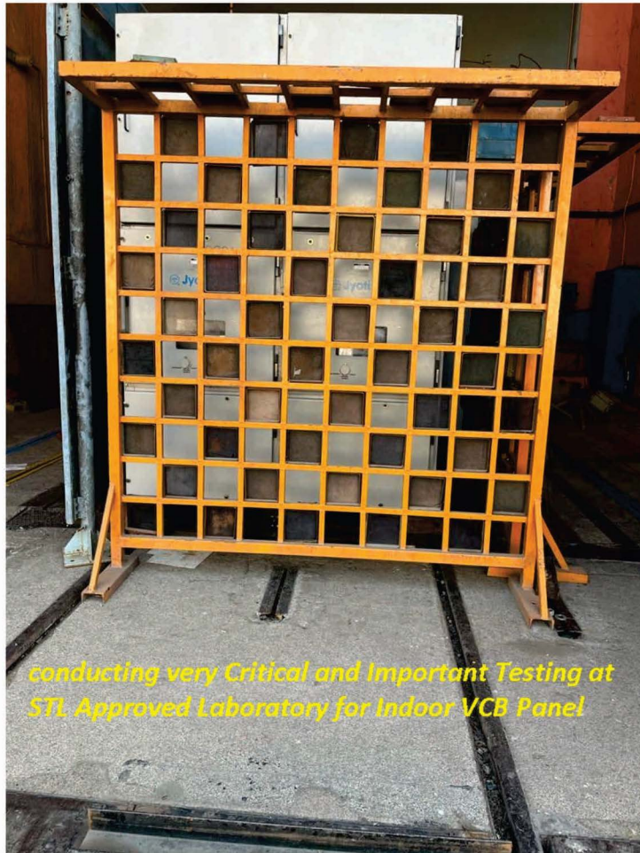
conducting very Critical and Important Testing at STL Approved Laboratory for Indoor VCB Panel