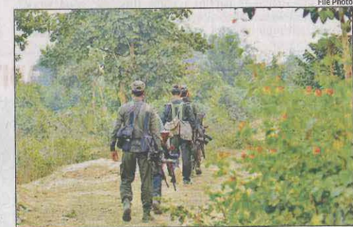
RED THREAT: CPI(Maoist) cadres near Jharkhand-Bihar border

According to police data, five Maoist rebels are carrying rewards of Rs 1 crore each on their head, while 62 have a bounty of Rs 1 lakh rewards, 32 carry a reward of Rs 2 lakh, 38 have Rs 5 lakh on them, 25 each carrying Rs 10 lakh, 19 each carrying Rs 15 lakh and 15 each carrying reward of Rs 25 lakh on