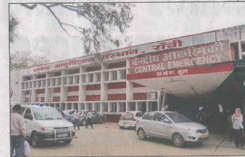
GEARING UP FOR NEW SERVICES: State-run hospital Rims

According to a letter issued by the Rims management on Wednesday, 13 doctors from seven different medical colleges have been selected for Rims. Talking to TOI, Rims di-