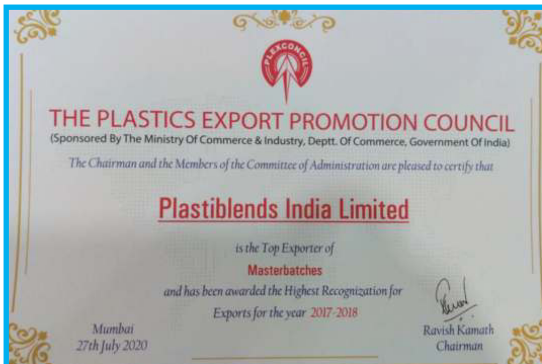
PLEXCONCIL Top Exporter of Masterbatch award for the Year 2017-18.