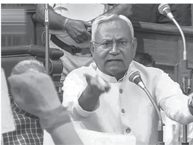
Manjhi alleged that "poisonous substances" were being mixed into the food served to Bihar CM Nitish Kumar, by those "coveting his chair".

Manjhi also disclosed that he would meet Governor Rajendra Arlekar on Saturday to apprise him of the "grim situation" prevailing in Bihar. "I also demand a high-level inquiry into the food served to Nitish Kumar which, I suspect, is being laced with substances which would make him go insane. There are some people around him who are coveting his chair", said Manjhi, who refused to elaborate further. Notably, Kumar had given Manjhi a tongue-lashing