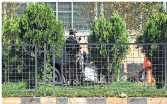
A Taliban fighter stands guard in front of the Russian embassy after a suicide attack in Kabul on Monday

call out the names of candidates for visas when the explosion occurred, the agency said. There was no immediate claim of responsibility for the blast, the latest in a series of bombings and other attacks since the Taliban seized power a year ago, deposing a Western-backed government and capping their 20-year insurgency. Monday's bombing, however, appeared to be the first to target a foreign diplomatic mission in Kabul since the Taliban takeover. The campaign of attacks has largely targeted Taliban positions or mosques of minority