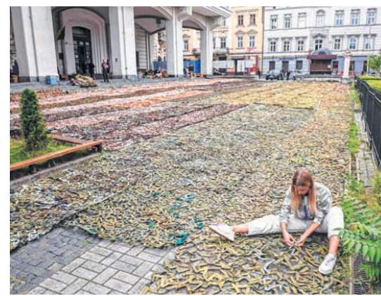
A woman makes camouflage nets for the Ukrainian military at the Lviv Art Palace in Lviv on Sunday

Tension still gripped Europe's largest nuclear plant on Monday, a day before UN inspectors were due to report on their efforts to avert a potential disaster at the Ukrainian site that has been engulfed by Russia's war on its neighbour. The Russian military accused Ukrainian forces of staging "provocations" at the Zaporizhzhia plant, which lies within a Russian-installed administrative area. Russia's defence ministry claimed that Kyiv's forces on Sunday targeted the territory of the plant with a drone, which it said Russian troops were able to shoot down. The ministry said Ukrainian troops also shelled the adjacent city of Enerhodar twice overnight. The two sides have traded accusations about endangering the plant, which Russia has held since March. The plant's Ukrainian staff continue to operate it. In a perilous mission, experts with the International Atomic Energy Agency travelled