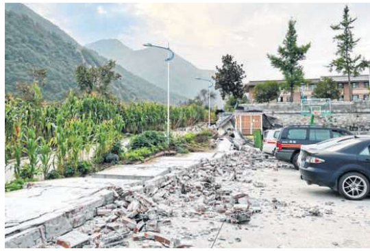
This photo shows the aftermath of a 6.6-magnitude earthquake in Hailuoguo in China's southwestern Sichuan province on Monday

At least 21 people were killed in China on Monday when a powerful earthquake of 6.8-magnitude jolted Luding County in the country's southwest Sichuan province, whose population is already reeling under a rising number of Covid cases and an unprecedented drought. The epicentre of the quake, which occurred at 12.25pm local time, was monitored at 29.59 degrees north latitude and 102.08 degrees east longitude at a depth of 16 kilometres, China Earthquake Networks Centre was quoted as saying by the state-run Xinhua news agency. The epicentre is 39 km away from the county seat of Luding and there are several villages