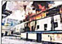
The fire was restricted to the top floor of the building

the fire to an extent," said a fire official.