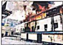
The fire was restricted to the top floor of the building

the fire to an extent," said a fire official.