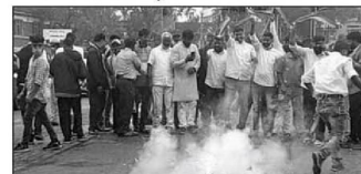
ಬೆಳಗಾವಿಯಲ್ಲಿ ಕನ್ನಡ ಕಾರ್ಯಕ್ರಮದಲ್ಲಿ ಸಂಭ್ರಮಾಚರಣೆ.