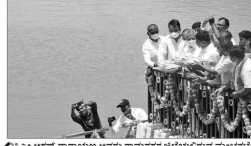
ಡಿ.ಎಂ. ಅಶ್ವತ್ಥ ನಾಯಕರು ಅವರು ರಾಮನಗರ ಜಿಲ್ಲೆಯಲ್ಲಿರುವ ಮಂಚನಬೆರೆ ಅರಿಸಿದರು. ಸಚಿವರಾದ ನಾಯಕಿ ಗೌಡ, ಬೈರತಿ ಬಸವರಾಜು ಮಂತ್ರಿಯರು.