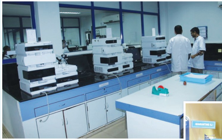
Quality Control Lab