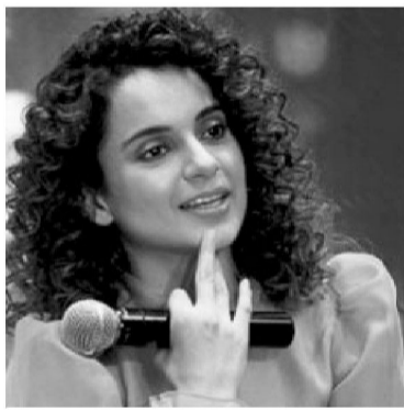
Actor Kangana Ranaut posted messages following the TMC win over the BJP and incidents of post-poll violence

like permanently suspending an account, it notifies people that they have been suspended for abuse violations, and explains which policy or policies they have violated and which content was in violation.