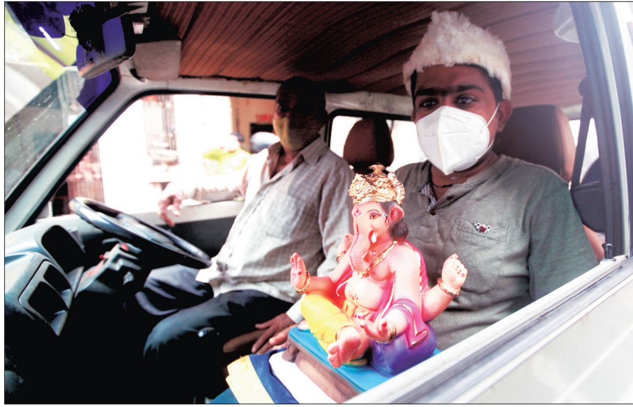
Men take home an idol of Lord Ganesha a day ahead of Ganesh Chaturthi, in Vadodara on Friday.

norms are followed by the attendees. The district election officer and district superintendent of police should ensure that the number of attendees does not exceed the limit prescribed by the State Disaster Management Authority for public gatherings, the commission said. Bihar will be the first state where assembly elections will be held amid the pandemic. The polls are likely to be held sometime in October-November. According to sources, elections could be held in Bihar in two or three phases. The Chief Electoral Officer will be holding an online meeting with all district magistrates on Monday. A district magistrate told The Indian Express, "A voter will have to use a mask and will be provided gloves. Pressing the EVM button could be the only direct touch during the voting process."