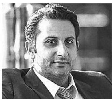
Poonawalla has repeatedly stressed in his interviews that he has no plans to list his firm — it would cause him to lose his "independence", he says

The bet paid off, and handsomely. SII now has the capacity to make 4 billion doses of Covishield annually. To understand the leap it's taken, consider this. In FY20, it was the world's largest vaccine maker, making about 1.5 billion doses of vaccines every year. The capacity ramp-up, thus, is not only huge, but also a major risk — diverting capacities from pipeline vaccines to make