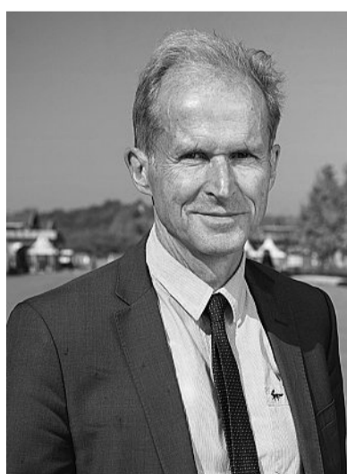
ERIK BERGLÖF Chief economist, AIIB

To expand these markets in land, or to find opportunities for people living there to get jobs or to provide opportunities for companies that want to invest there, we will need good infrastructure, and we need to provide better access to ports, airports and so on. For example, China for decades has seen growth in markets near the port as the connectivity and export strategies assist in making the market more approachable. One way to tackle this issue is infrastructure growth