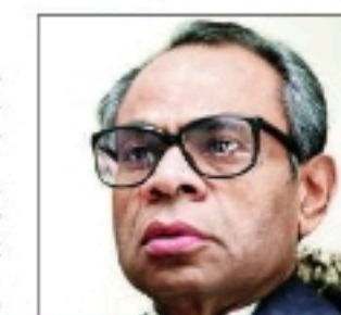
BINDING FORCE IN FAMILY

When SP Hinduja entered the family business in 1952, his father had made Iran the hub of his trading business — he would export carpets and dry fruits from Iran and import textiles and tea from India. The Hinduja Group remained headquartered in Iran till 1979. But, when the Islamic revolution swept out the Shah and brought Ayatollah Khomeini to office, SP and his family members shifted base to London, which remains the conglomerate's HQ even now. SP helped to broaden the family's business interests. The group established a finance company, Hinduja Bank, in Switzerland. It later acquired Gulf Oil Internatio-