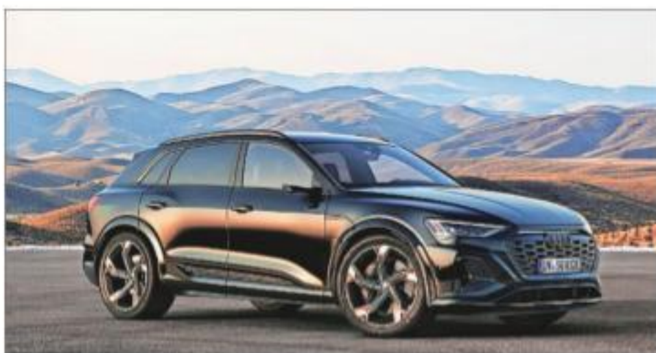
The Q8 e-tron is expected to come to India as a completely built unit import, and therefore will be very expensive, because carmakers have to pay 100% duty. It is priced at about $74,000 in the US

Audi India's electric car range starts at ₹1.02 crore (e-tron) and tops at ₹1.94 crore