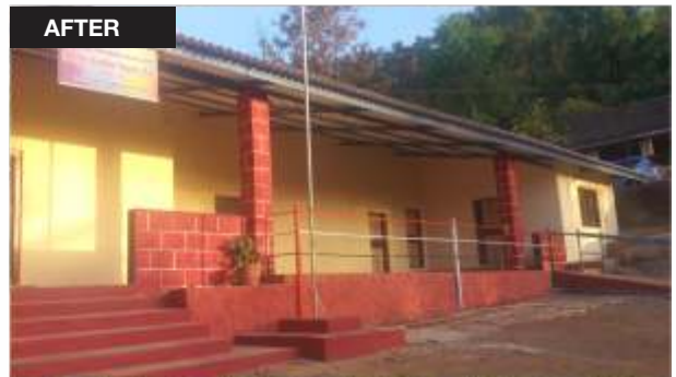
Building and maintenance of sanitation units, Ghaziabad, Uttar Pradesh