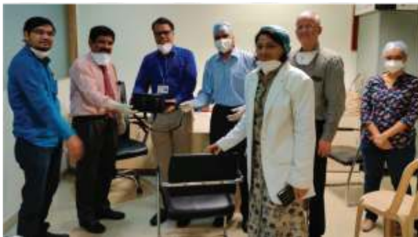
Essential medicines donated to COVID-19 hospitals in Mumbai