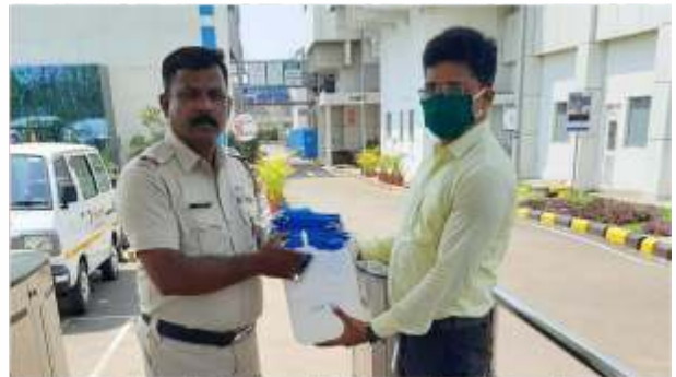
Masks and sanitizers provided to essential service workers in Kolhapur