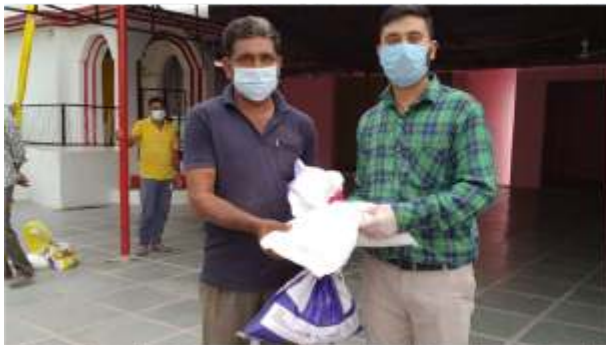
Essential ration items donated to the villagers in Baddi