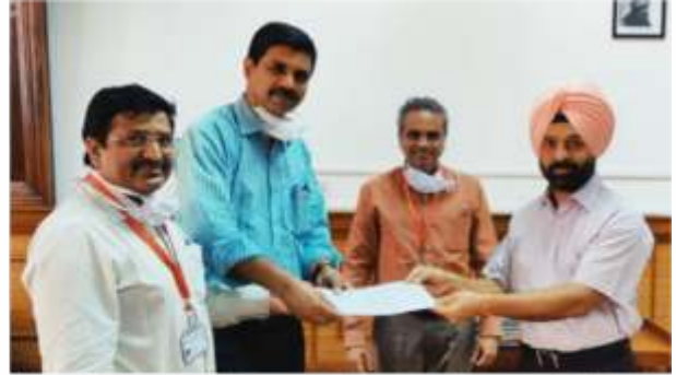
Essential utility items presented to COVID-19 warriors in Goa