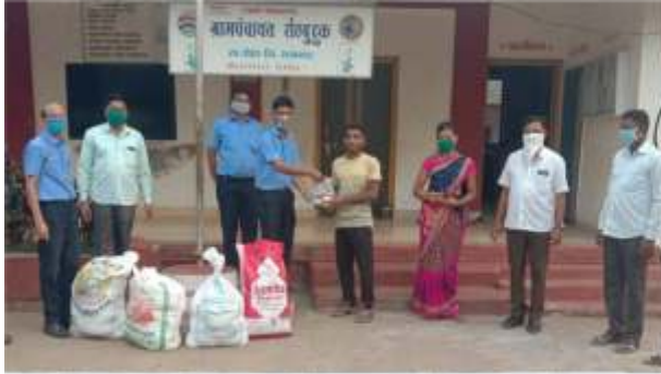
Grocery kits donated to Panchayat in Roha