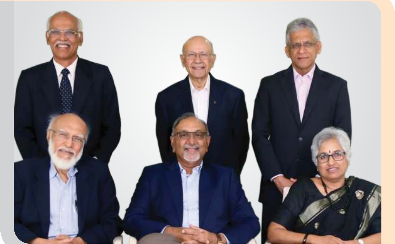
(L) to (R)