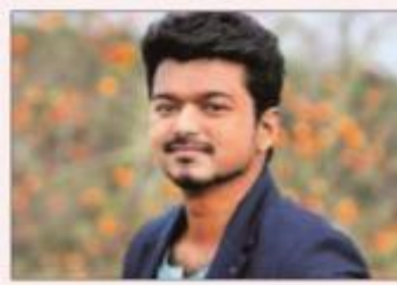
Tamil actor Vijay

State Congress chief KS Alagiri rallied behind Vijay and said there were chances that the searches could be aimed at