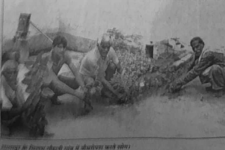
वर का गिवलभा सीवानी सांघ में मीबसीपमा करते