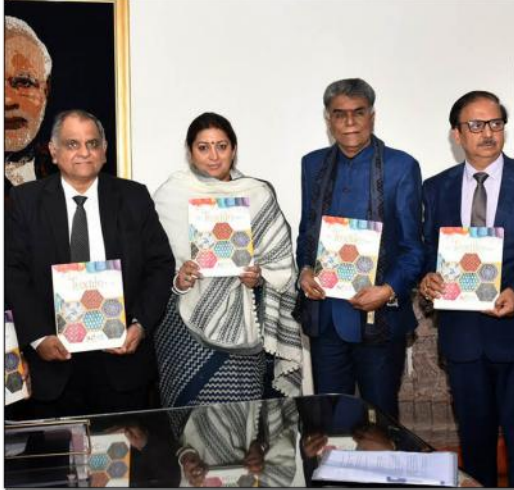
The Union Minister for Textiles, Smt. Smriti Irani releasing the Millennium Post + Industry for Textiles Booklet, in New Delhi.