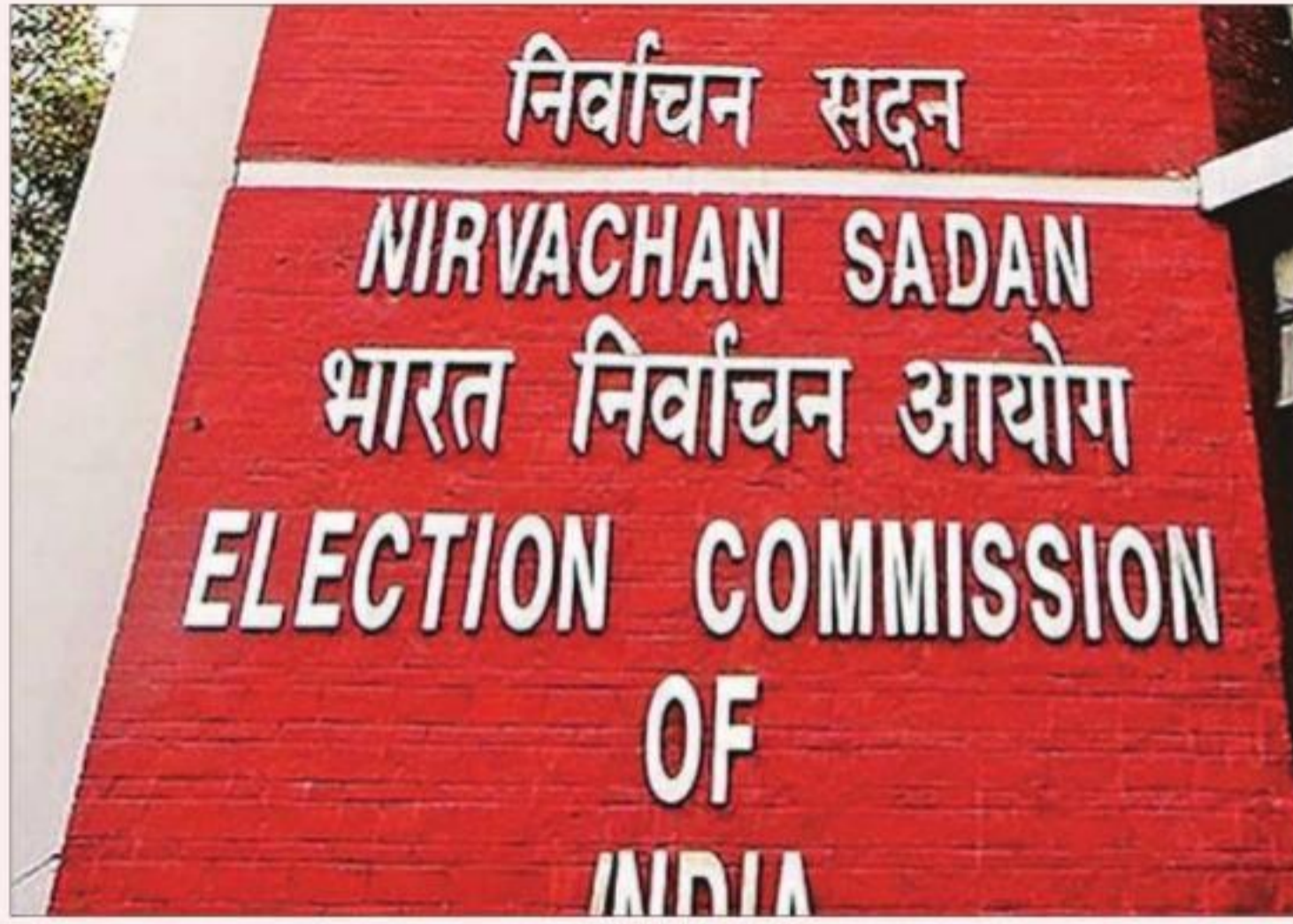
The purpose is to improve the health of electoral rolls and augment enrollment of all eligible citizens during special summary revision of the electoral rolls