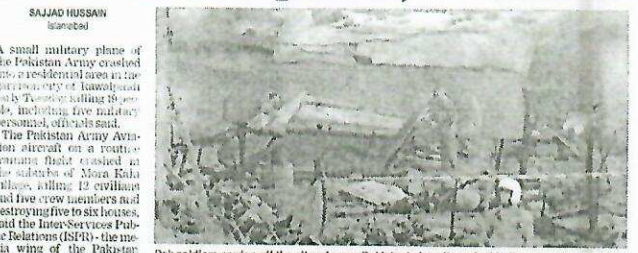
Pak soldiers cordon off the site where a Pakistani aircraft crashed in Rawalpindi.

A small military plane of the Pakistan Air Force crashed into a residential area in the northwestern city of Islamabad early Tuesday, killing 19 people, including five military personnel, officials said.