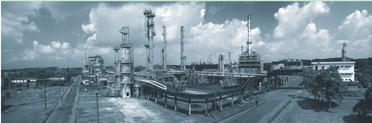
Phenol Complex at Kochi