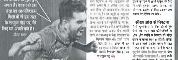
चमत्कारिक चाहर... चमत्कारिक चाहर... चमत्कारिक चाहर...