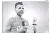
Chahar was player of the tournament in the T20 series against Bangladesh. He has scored 1,000 runs in 10 matches.

India's pace bowler Shreyas Iyer has moved up 88 places in the T20I rankings to 11th place. He has scored 1,000 runs in 10 matches. He is the only Indian bowler to have scored 1,000 runs in T20I matches.