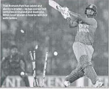
Rishabh Pant has talent and ability to become a batsman. He has to be given a chance to prove himself. What is lost is that he has to be given a chance to prove himself.

Every time I hear the name Rishabh Pant, I think of a young man who has a lot of talent and ability to become a batsman. He has to be given a chance to prove himself. What is lost is that he has to be given a chance to prove himself.