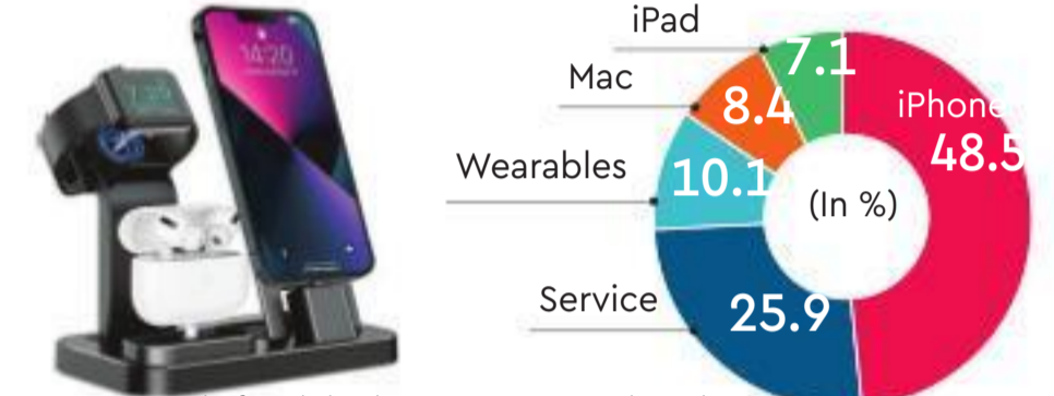
Source: Apple fiscal third-quarter report, Bloomberg

The iPhone & wearables categories make up more than half of revenue