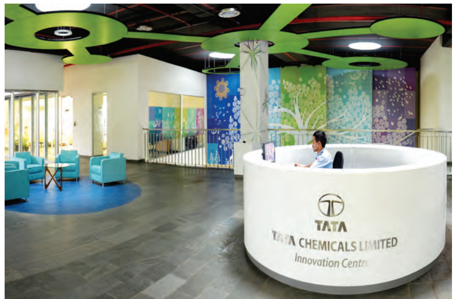
Experience Center for Tata Chemicals, Pune