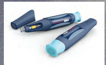
Innovation - Fixed Dose Pen for Drug Delivery

Tata Elxsi's Medical Device and Healthcare practice is ISO 13485 certified.