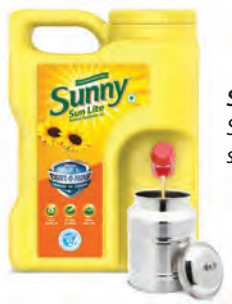
Sunny Sun-lite refined sunflower oil jar