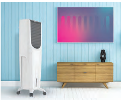
Orient Ultimo Tower Cooler