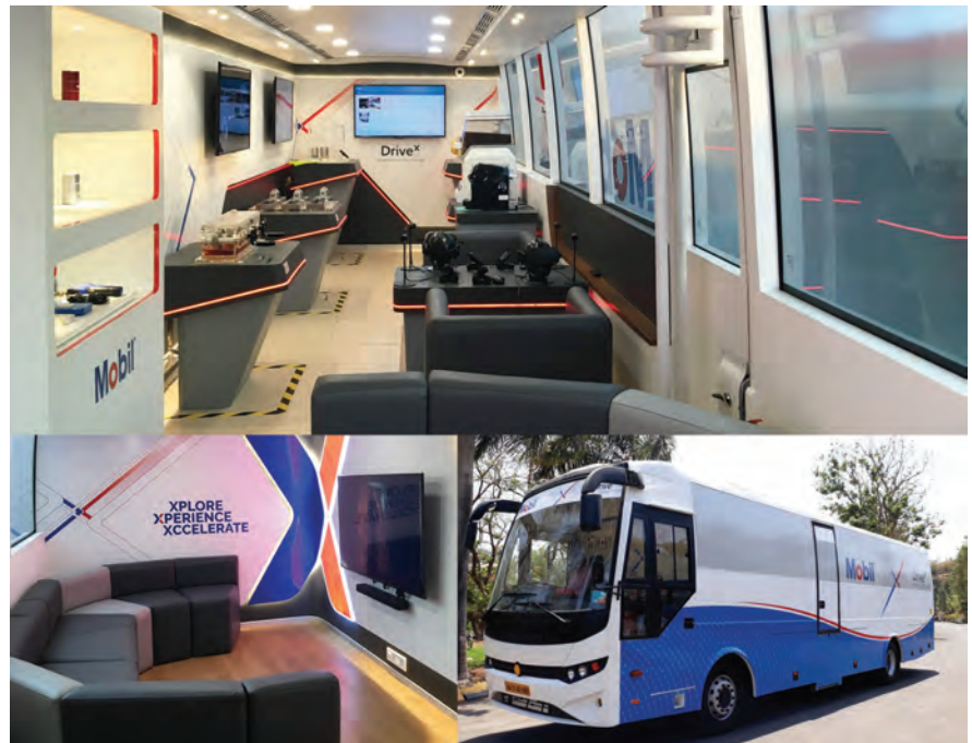
Mobil Drive X – An immersive platform for meaningful engagement with customers

Tata Elxsi helps customers create innovative products, services, and experiences to build brands and help businesses grow. By intersecting design and technology, we help clients globally to bring new ideas and products to market.