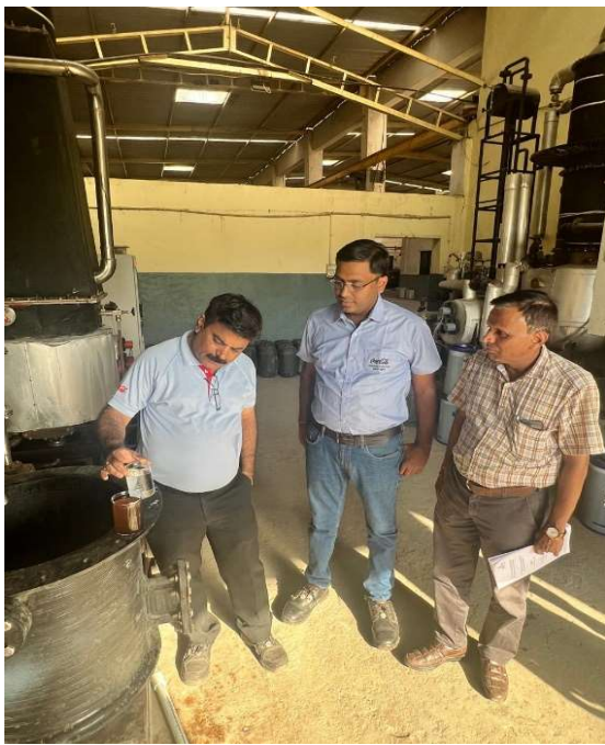
Coca-Cola team analyzing samples