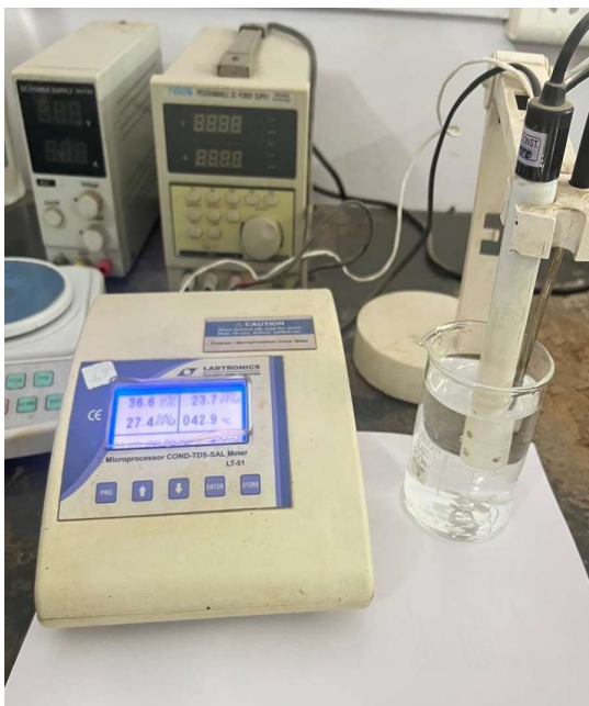
Sample Parameter after treatment