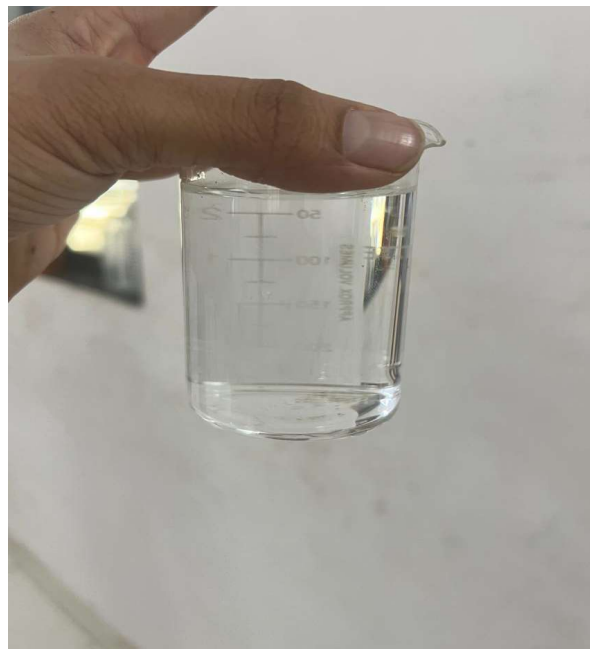
Sample after treatment