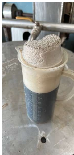
Sludge stream of Salty Waste water