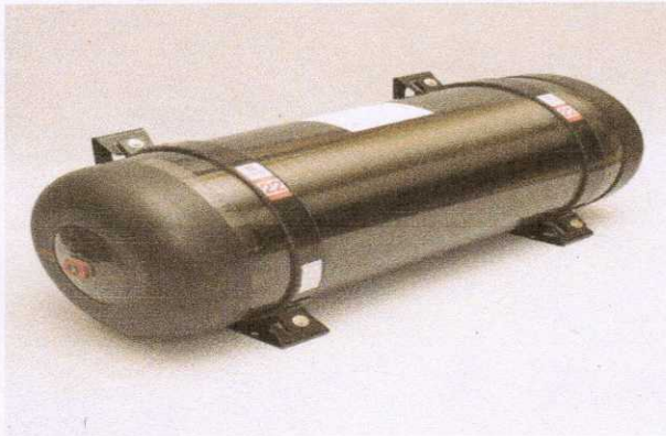
Carbon Fiber wrapped Composite Cylinder Type-IV for CNG (On Board Application)