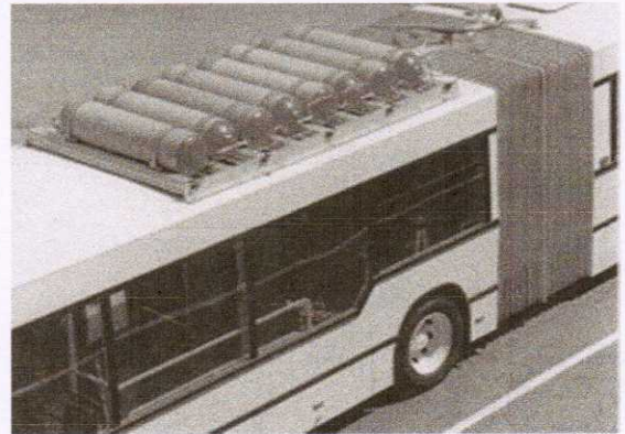
CNG Type-IV Composite Cylinder for vehicle (On Board Application)

This is further to Company's communication of August 17, 2020 concerning CNG Cascades with Carbon Fiber Reinforced Wrapped Type-IV Composite Cylinder. The Company produced Type-IV Composite Cylinder for the first time in India and got necessary approval from Petroleum and Explosives Safety Organization (PESO) (formerly CCOE) and Bureau Veritas under International Standard ISO: 11119-3:2013.