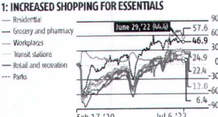
Note: Latest update is as of July 6, 2022, based on location data as processed by the company. The percentage change is relative to the baseline value for the same day of the week, calculated on a median basis during 7-week period Jan 1-Feb 6, 2020. The data shows a seven-day rolling average of 100% for each category. Residential data refers to change in time spent at home.

The Indian railways showed higher growth than before in the quantity of goods