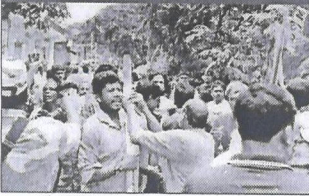
লাঠি হাতে মারমুখী বিজেপি কর্মীরা।