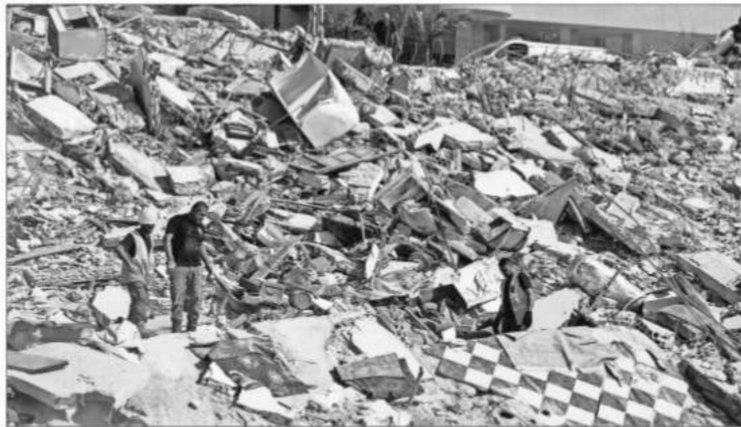
Emergency workers at the site of recent Israeli attack on the city of Ain Deleb in southern Lebanon on Monday.

Speaking to troops deployed along Israel's northern border, defence minister