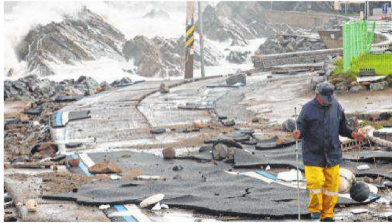
A man walks along a damaged coastal road in Ulsan on Tuesday, as Typhoon Hinnamnor hit South Korea's southern provinces

After grazing the resort island of Jeju and hitting the mainland near the port city of Busan, Hinnamnor weakened as it blew into waters between the Korean Peninsula and Japan.