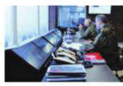
he appears to limp as he observes military drills

Russian President Vladimir Putin appeared to walk with a limp as he attended Russia's major Vostok war games on Tuesday, raising fresh doubts over his health, Daily Mail reported.