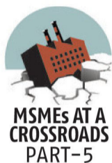
MSMEs AT A CROSSROADS PART-5

According to an industry source, at least 100 companies in Ambattur were shut down after the outbreak of Covid-19. "There units saw job losses to the tune of around 50-60 per cent of their total employees. Nearly 100 companies were shut down. Though they were struggling even before Covid, this was the last nail in their coffin. The majority of the SMEs that shut shop were auto ancillary units, owing to their lower margins and inability to diversify," said the owner of an SME, requesting not to be named.