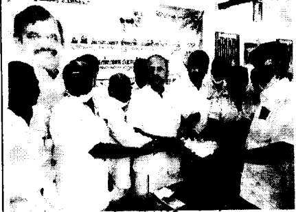
தாம்பரம் பெருங்கனத்தூர் அருகே அனாமலை இன்று அதிகாலை அரிவேலாமலை வழக்கில் கார் மோதுவதில் இறந்த மாணவர்களின் பெயர்கள்...