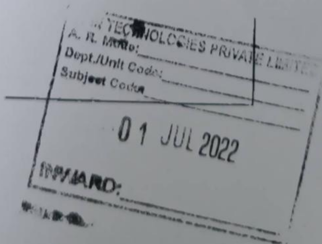
SHILPA YAGNESH SHAH