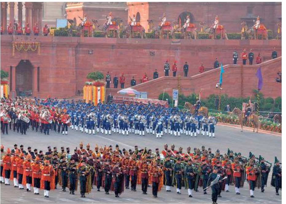
Beating Retreat event at Vijay Chowk on Friday.

The event started with Navy, Army and Air Force