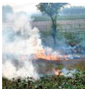
The reasons behind pollution in Delhi are a matter of constant debate. • FILE PHOTO

The proposed study is different from the earlier