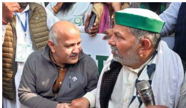
Deputy Chief Minister Manish Sisodia with BKU leader Rakesh Tikait at the Ghazipur border on Friday.

Meanwhile, Water Minister Satyendar Jain, who had visited the Singhu border with water tankers claimed that the police did not even allow supply of basic facilities such as water to the farmers on the BJP's orders. "It's unfortunate that 'sardars', who are strong patriots, are being called traitors. The real traitors are the ones who are calling the farmers that. Central go-