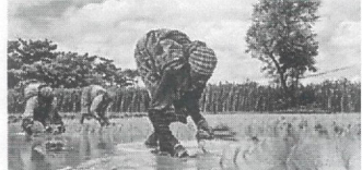
The MSP notified under it was to be enforceable for any transactions in the state with regard to farmers' produce, irrespective of whether this transaction happened within mandis, cooperative societies, or any other collectives.

The government has decided to shelve the current draft Bill on guaranteeing MSP and rework it, said two sources aware about the development.