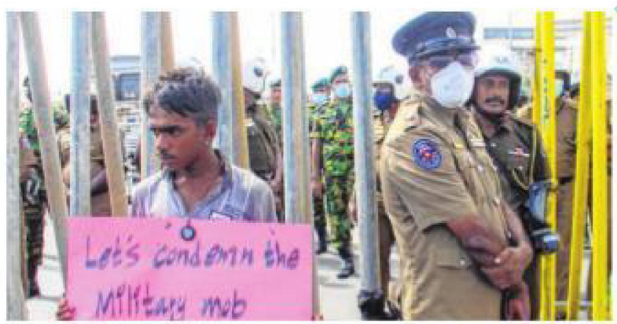
An anti-government demonstrator holds a placard during a protest near Presidential Secretariat in Colombo on Monday.

The Secretariat resumed operations under a tight security cover, they said.