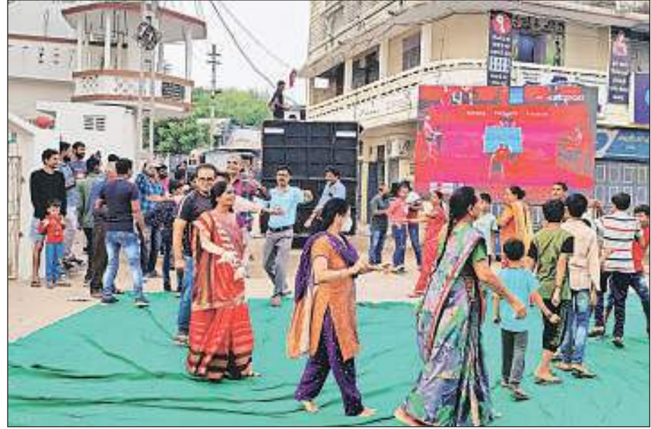
Family members of Paralympics silver medalist Bhavina Patel celebrate her win at Visnagar town of Mehsana district on Sunday.

Looking at the previous year's trends, the months of September, October and November in 2020 reported the highest cases-125, 291 and 226, respectively.