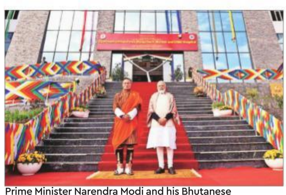
Prime Minister Narendra Modi and his Bhutanese counterpart Tshering Tobgay at the Gyaltsuen Jetsun Pema Mother and Child Hospital in Thimphu

PRIME MINISTER NARENDRA Modi and his Bhutanese counterpart Tshering Tobgay on Saturday inaugurated a hospital built with Indian assistance which will offer quality health-care for women and children and be a shining example of India-Bhutan development cooperation.