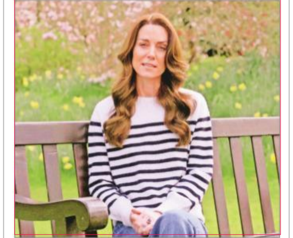
Britain's princess Kate Middleton announced she was suffering from cancer in a video message, following which she received an outpouring of support and admiration from the world over