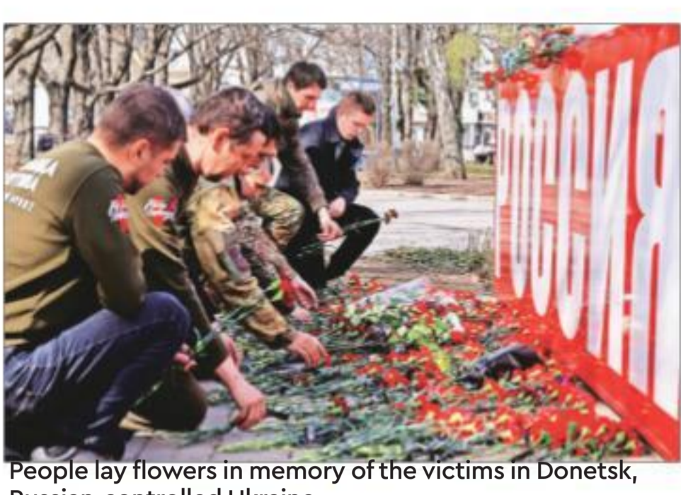
People lay flowers in memory of the victims in Donetsk, Russian-controlled Ukraine