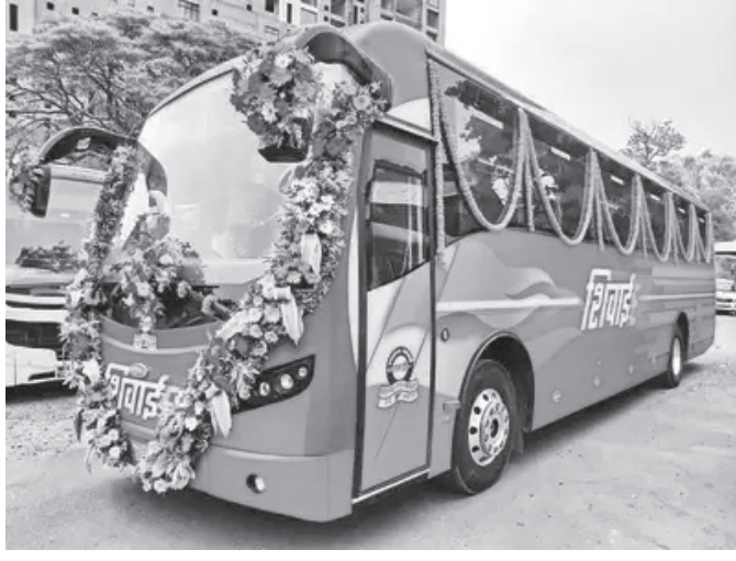
इलेक्ट्रिक बसेस छत्रपती संभाजीनगरच्या