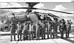
Army chief General Manoj Pande after flying an Apache attack helicopter in the Ladakh sector on Sunday.

Rajat.Pandit@timesgroup.com New Delhi: India and China on Monday "virtually" completed the troop disengagement process because the final agreement at Patrolling Point 15 in the Gogra-Hot Springs area of eastern Ladakh, which India hopes will set the stage for further negotiations on the more crucial face-offs at the strategically located Depsang Plains and Demchok. The phased manual pullback of troops from the stand-off site at PP-15 near the Kurgam Khilab, with dismantling of the area and the creation of a "no-patrol buffer zone", was initially slated to be fully completed by Monday. Sources, however, said there has been a slight delay in the overall disengagement process because the final physical verification is still to be carried out by the two sides. "It should be completed by Tuesday," a source said. The buffer zone at PP-15 will be the fourth one to be established in the over 28-month-long military confrontation with China in eastern Ladakh. The earlier zones, varying from 3 km to almost 10 km, came up at PP-14 (Gaban Valley), PP-2A (Gogra Valley), Pungtso, Tso-Kalash Range region after troop engagements at those face-off sites.