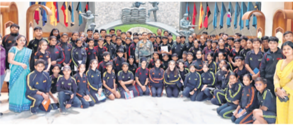
OUR STAFF REPORTER city.indore@fpj.co.in

New Digamber Public School Indore took students for a visit to the Infantry Museum in Mhow on August 1 and 2.