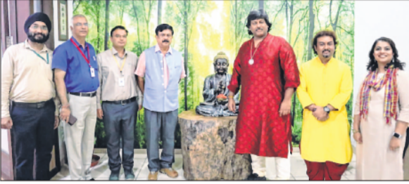
OUR STAFF REPORTER city.indore@fpj.co.in