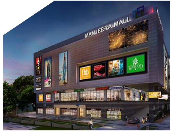
Manjeera Mall, Rajahmundry