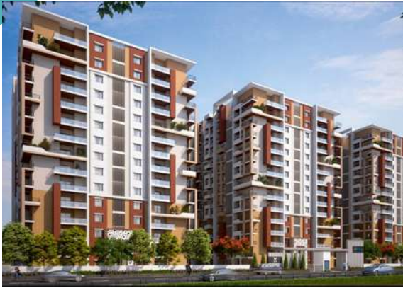
Vasavi Lake City, Hafeezpet