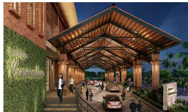
Manjeera International Convention Centre