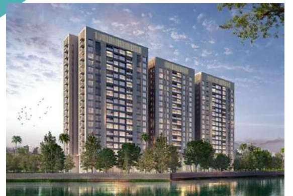
Newyork by Manjeera, Bangalore