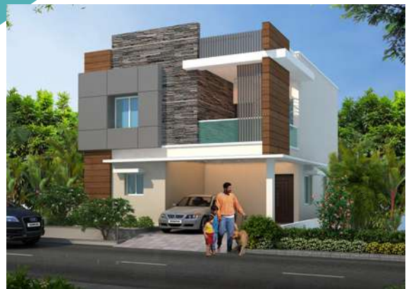
Manjeera Blue, Ongole