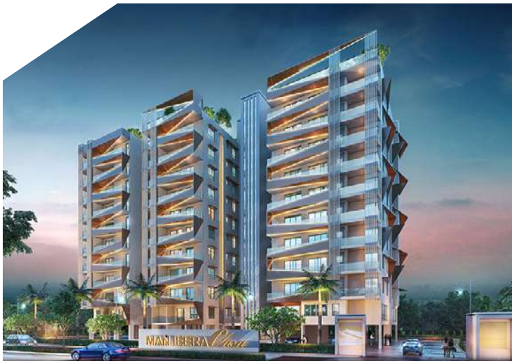
Manjeera Casa, Hyderabad