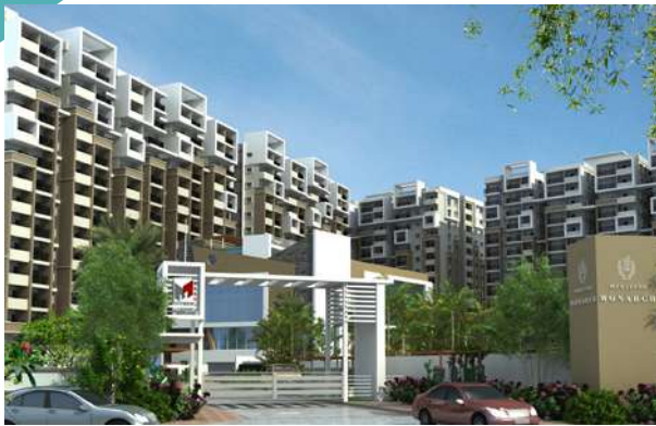
Manjeera Monarch, Vijayawada