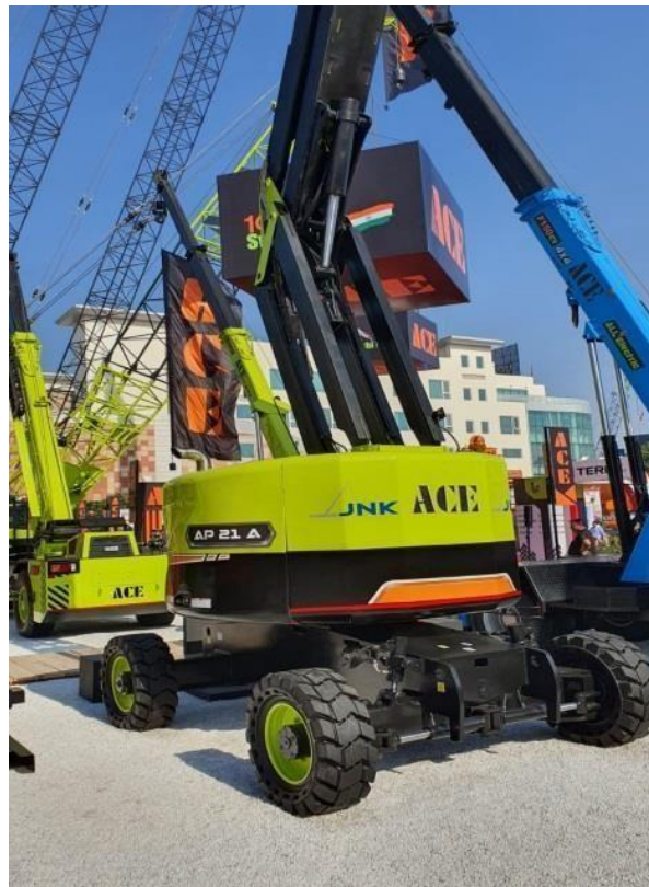
India's First Self Propelled Aerial Work Platforms