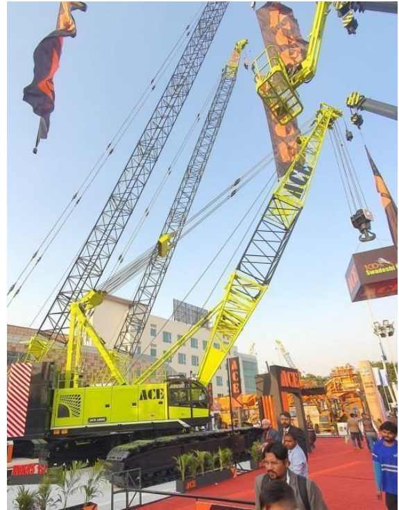
India's largest indigenous Crawler Crane with a lifting capacity of 180 Tons