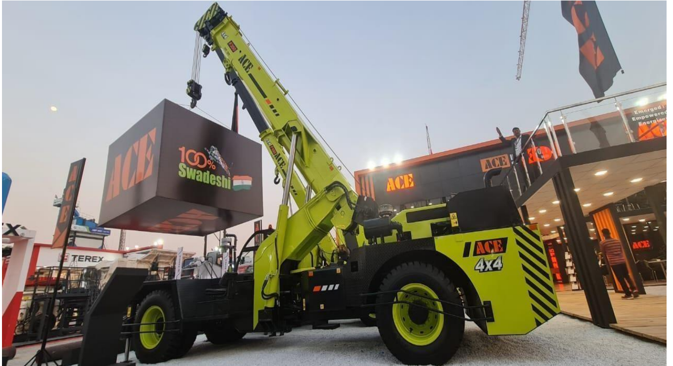
35 Tons 4X4 Pick and Carry Crane