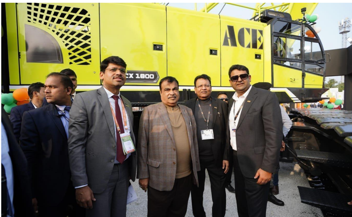
ACE- India's First Fully Electric Mobile Crane & other products launched by Mr. Nitin Gadkari, Hon'ble Minister of Road Transport and Highways at BAUMA ConExpo 2023