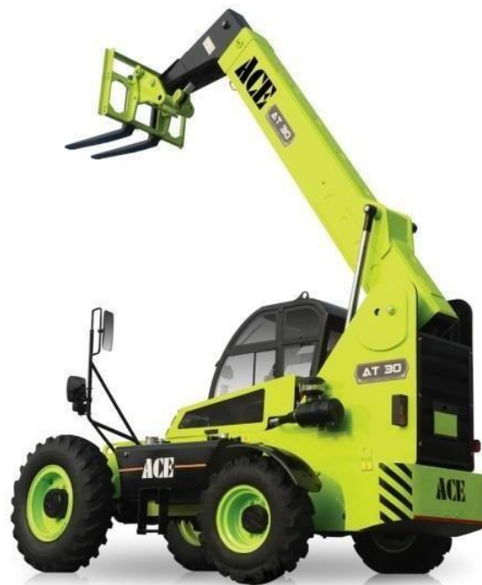
Range of Telehandlers