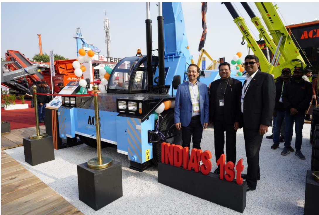
India's First Fully Electric Mobile Crane