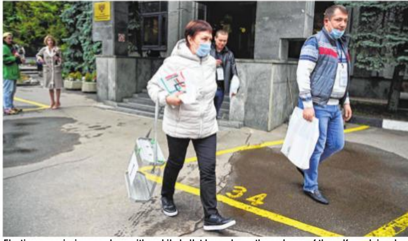
Election commission members with mobile ballot boxes leave the embassy of the self-proclaimed Donetsk People's Republic, the eastern Ukrainian breakaway region, in Moscow on Friday

The referendums follow Russian President Vladimir Putin's order of a partial mobilisation, which could add about 300,000 Russian