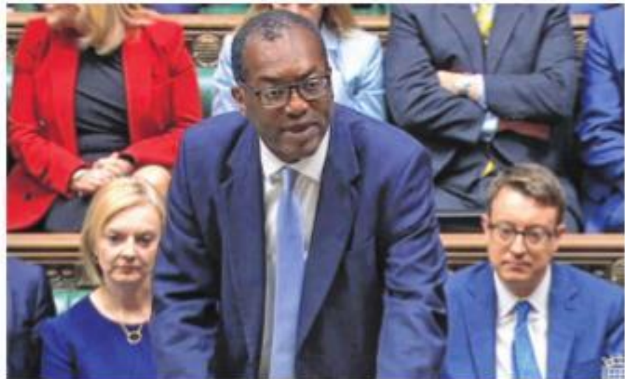
Britain's Chancellor of the Exchequer Kwasi Kwarteng unveiling an anti-inflation budget plan at the House of Commons on Friday

for a new era, focused on growth," Kwarteng told lawmakers in the House of Commons.