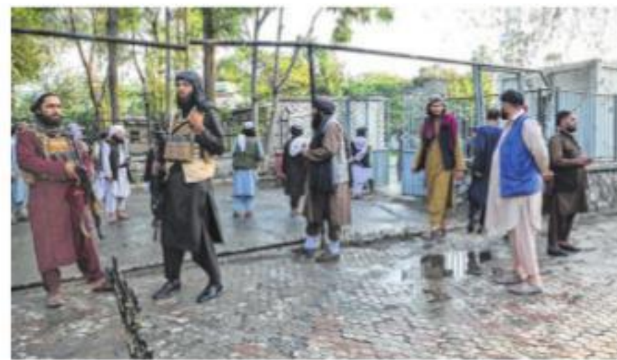
Taliban fighters investigate at the site of the blast

The blast took place near the Wazir Akbar Khan mosque.