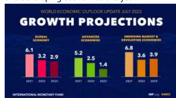
World Economic Outlook

The baseline forecast is for growth to slow from 6.1 percent last year to 3.2 percent in 2022, 0.4 percentage point lower than in the April 2022 World Economic Outlook. In China, further lockdowns and the deepening real estate crisis have led growth to be revised down by 1.1 percentage points. Global inflation has been revised up due to food and energy prices as well as lingering supply-demand imbalances, and is anticipated to reach 6.6 percent in advanced economies and 9.5 percent in emerging market and developing economies this year.