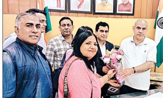
हरियाणा के उच्चतर शिक्षा मंत्री से मुलाकात करते कॉलेज टीचर्स एसोसिएशन और नॉन टीचिंग यूनिट का प्रतिनिधिमंडल।