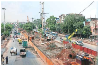
The incident took place on the Saharanpur highway construction site in Northeast Delhi. Archive