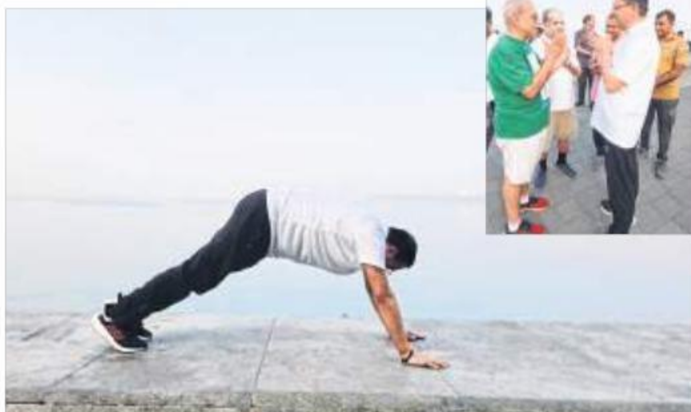
Uttarakhand Chief Minister Pushkar Singh Dhami on Tuesday performed yoga and Surya Namaskar on Marine Drive