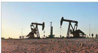
The average landed price of Russian crude for Indian refiners for the April-September period was $71.83 per barrel