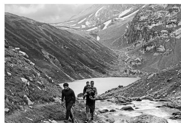
aero adventures, offering options to explore the region.

The Director of Tourism further added that as part of the ongoing initiatives, J&K Tourism is actively promoting 75 new trekking routes and that efforts are underway to boost