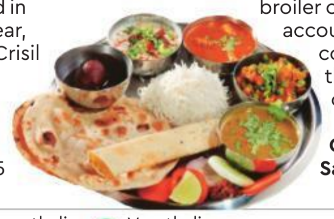
Compiled by Sandip Das

After a sharp fall in tomato, potato and broiler chicken prices, the overall cost of a household vegetarian and non-vegetarian thalis declined in October on year, according to Crisil data. The cost of a vegetarian thali declined by 5% to ₹27.5 last month from ₹29 a year ago. On the other hand, the prices of non-vegetarian thali declined last month by 7% to ₹58.4 on year as broiler chicken prices, which accounts for 50% of the cost of the non-veg thali, softened by 7% on year.