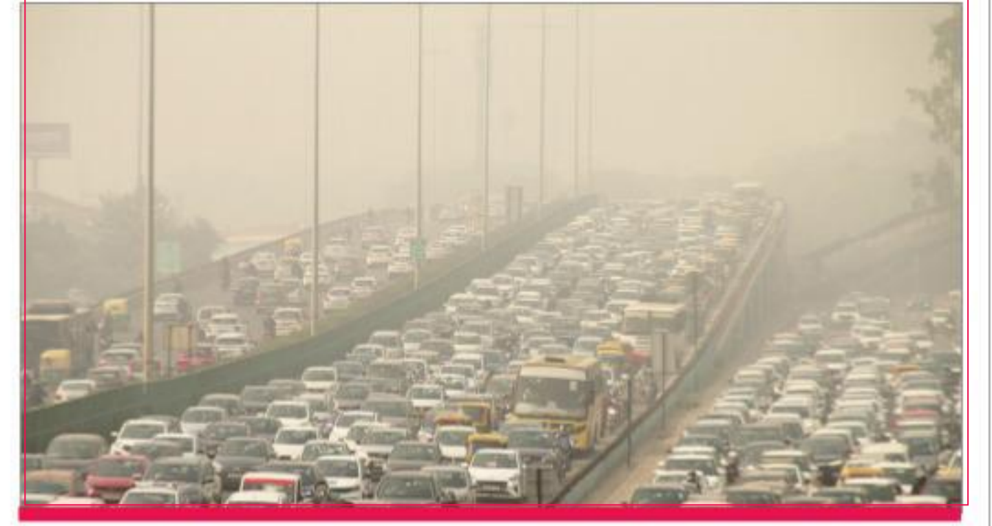
Vehicles stuck in a traffic jam on Delhi-Gurgaon Expressway amid low visibility due to smog during on Monday. The odd-even car rationing system will be enforced from November 13 to 20 to combat air pollution in the city which was seven to eight times above the safe level on Monday.