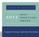
FROST & SULLIVAN Best Practices-2013