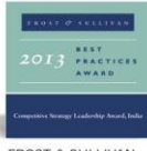
FROST & SULLIVAN Best Practices-2013