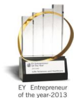
EY Entrepreneur of the year-2013