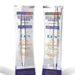
Business today/YES bank Excellence Awards-2013