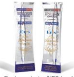
Business today/YES bank Excellence Awards-2013